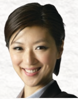
容海恩大律師 Ms. Eunice Yung 法律顧問